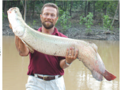
Fishing a murky creek yielded this juvenile Arapaima. They can exceed 250 lbs.

size of the Cichla Temensis pictured on these pages, Monoculus provides great sport on light tackle and is one of the most beautiful of all peacocks. This specimen was caught in the Igapo Acu.