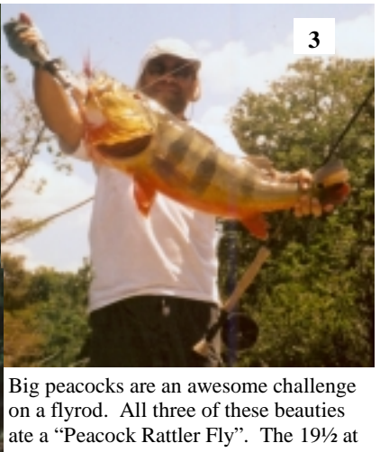
Big peacocks are an awesome challenge on a flyrod. All three of these beauties ate a "Peacock Rattler Fly". The 19½ at left (#1) is from the Unini. The Matupiri yielded an 18 pounder (#2) and the 21½, above (#3), is from the Alegria.