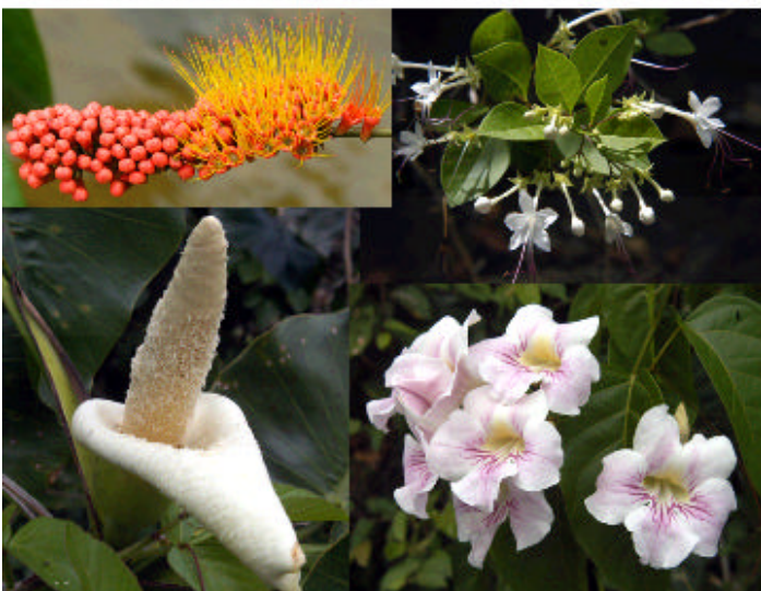
The surrounding jungle is rich in life. Exotic flowers, fruits and wildlife lend an added dimension to the Urariquera experience.

The newly built camp is comfortable, bright and airy. It lets you live indoors without losing touch with the great outdoors. Our fleet of boats are specially designed to be able to navigate the Urariquera's challenging waters.