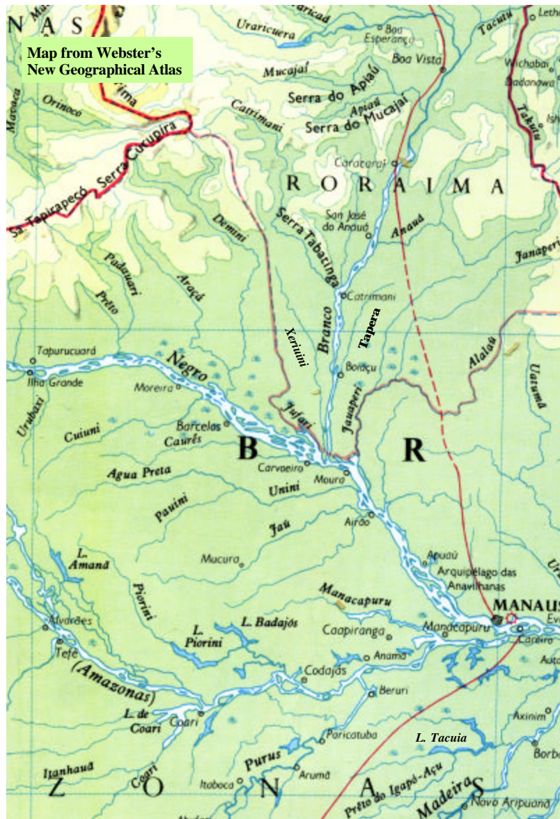
The dry season moves from the south to the north (from bottom to top on the map) as the season progresses, from September through March.

The end result of a season's worth of shuffling and dancing was another good fishing season for us even though the region was wallowing in the midst of the fishery's worst conditions in years. We were very lucky. After a decade of Amazon experience we've found that the harder we work, the luckier we get.