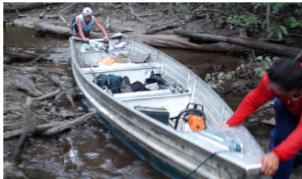
Catching a 20 pound trophy provides enough energy for daughters to take over boat pushing when dad runs out of steam.

We hurriedly ate our lunch and replenished our energy, as we knew our fishing time was cut short by all the travel ahead. It was time to get to work so I threw in a yozuri minnow and began to test the waters. I don't think it would be too much of an exaggeration to say that I felt a fish on every cast. The lagoon was loaded. I hauled in a 12, a 14, a 17 and a 15, and then finally I landed my first ever 20 lb peacock bass (see page 1). I was on cloud nine. Not only was I catching lots of fish but they were almost all well over 10 lbs.