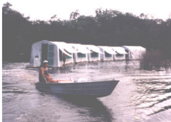
Mobile floating bungalows allow the camp to constantly access fresh, new fishing waters.

You'll need to look far west on your maps