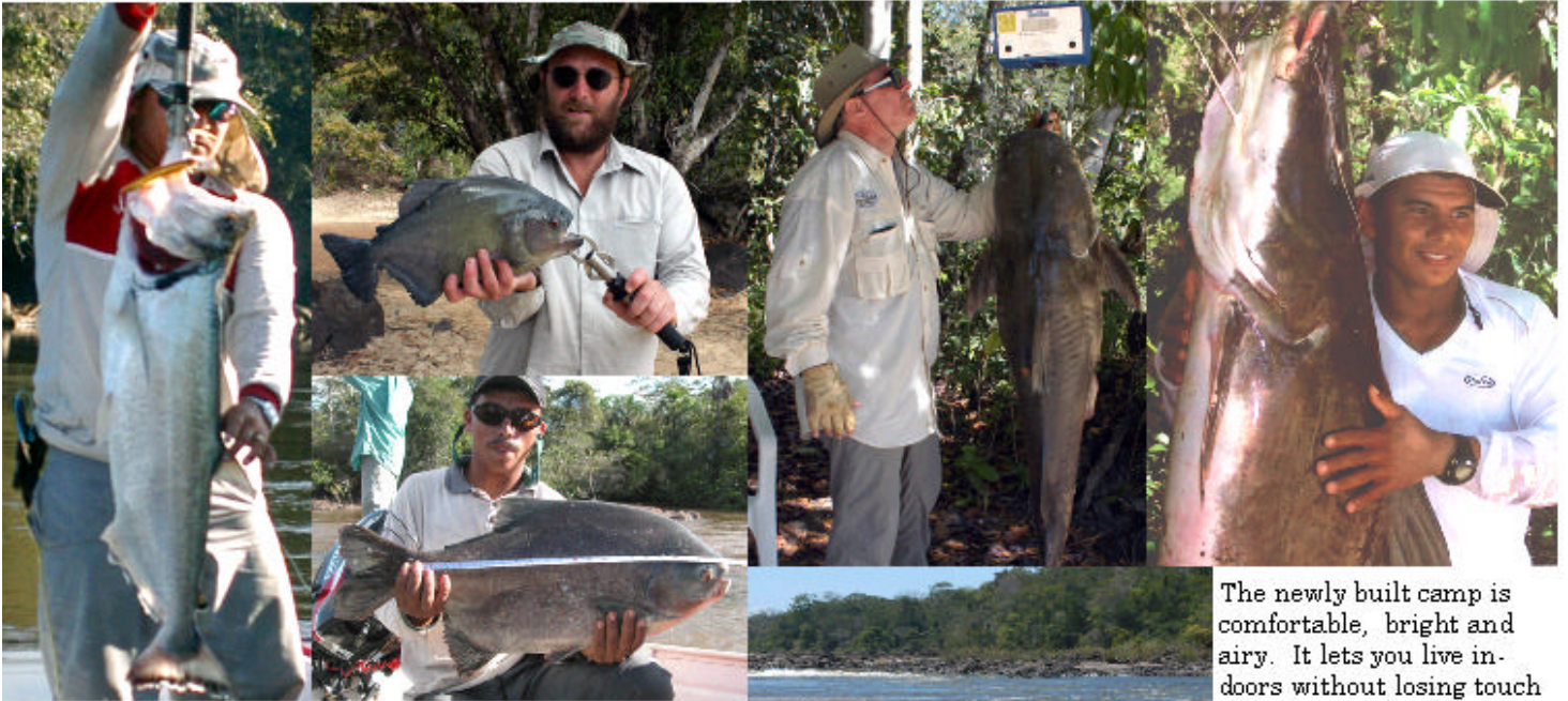
The Urariquera abounds in sportfish—and they get huge!

The newly built camp is comfortable, bright and airy. It lets you live indoors without losing touch with the great outdoors. Our fleet of boats are specially designed to be able to navigate the Urariquera's challenging waters.