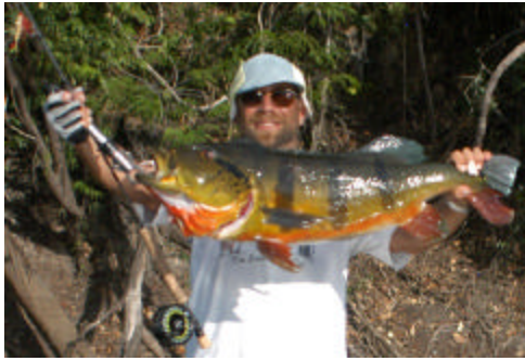
The Xeriuini's clear water makes for great sport on both fly and conventional tackle.

Acute Angling, in cooperation with Amazon Peacock Bass Fishing Adventures, has created a unique, new Thanksgiving Holiday trip package. The beautiful Xeriuini River is