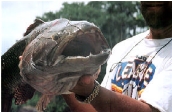
The Jatapu's variety includes the outrageous looking traira and a unique local strain of large peacocks.

A three day visit here, three years ago gave us a tantalizing taste of the