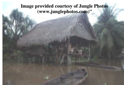
Image provided courtesy of Jungle Photos (www.junglephotos.com)" Flooding in the Amazon makes peacock bass fishing unproductive.

Note: As I arrived at the Manaus airport on my way home, having bowed to the unmanageability of the adverse conditions, I was startled to see a column of over 50 anglers arriving, rods tubes erect and ready to fish. My mouth wanted to run over and yell, "Go back, go back", but fortunately my brain took control. No sense making them miserable ahead of time. Clearly some operator(s) had opted to allow this horde of anglers to come, knowing full well that they were not likely to see more than a dozen or so fish all week! We consider putting profit before customer satisfaction to be improper and we will never knowingly put you in this position. We will always give our clients the opportunity to reschedule and avoid such circumstances.