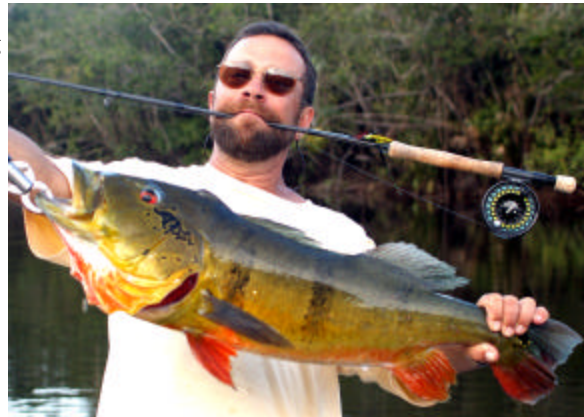
Fly-fishing doesn't get much better than this!

During certain of our trips, after a half week of fishing in Macaroca's beautiful waters, we are able to take advantage of accommodating conditions and fish our way upriver to Macaroca's sister lodge, Posao. This migration gives our anglers the opportunity to experience a totally different region, with dif-