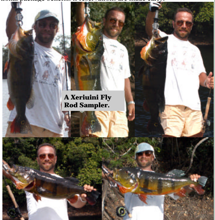
A Xeriuini Fly Rod Sampler.

The Xeriuini is an excellent destination for any fisherman and companion; from first time or part-time peacock anglers to masters of the art. During the winter-long dry season, the river consistently provides high daily catch numbers with an excellent percentage of medium to large peacocks up to 22 pounds. Jigs, jerk baits and big surface plugs account for most of the conventional caster's success. The crystalline black water provides remarkable visibility, making the Rio Xeriuini a fly fisherman's delight and one of the best fly-fishing rivers in the Amazon. We've put together our 2006 schedule, including an expanded (optional) two lodge itinerary, at the Xeriuini's economical $3200 regular price. Full groups are welcome and, with our new advance group policy, they can earn additional package benefits if reservations are made early.