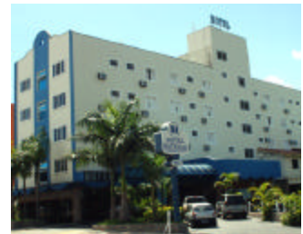
Hotel Nacional - Corumba

South Americans have been fishing for dorado since long before the first Europeans stumbled onto its shores. The Paraguay river drains the Pantanal, a giant fish nursery half the size of the state of Texas. Dorado, being migratory fish,