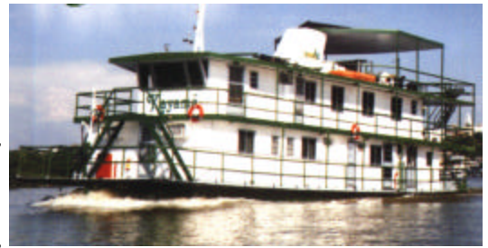
Kayama, Santa Lucia's slightly smaller sister ship.

In February, with our trips scheduled for April and May, we headed back to put together the pieces that will make it all work. We needed a houseboat, charter air-planes, camp staff, translators, vans, drivers, a hotel, scheduled flights, supply mechanisms and all the fuel,