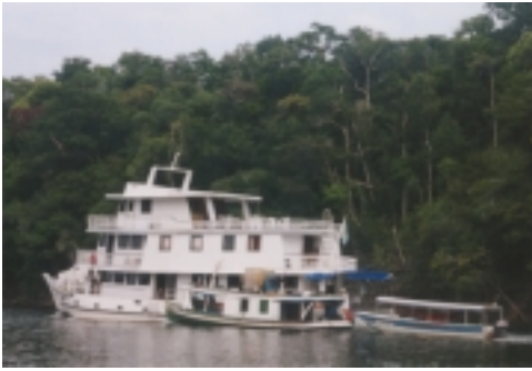
Day or night, seeing the waiting Amazon Angel come into view was a pleasant sight.