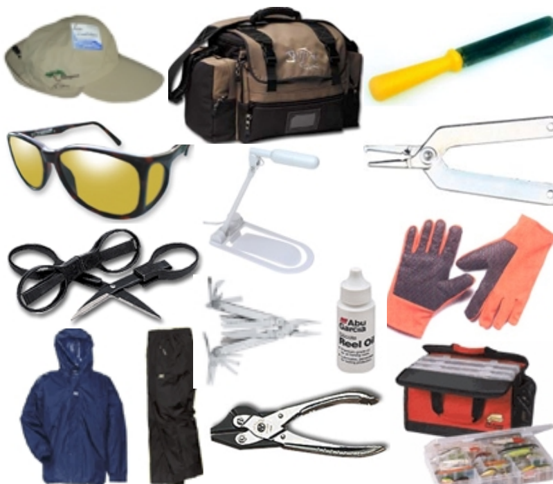
Accessory packages offer just about anything you'll need on your trip

After booking a trip with Acute Angling, our customers receive a package of preparatory materials, including a Pre-Trip Checklist. This information sheet helps you prepare for your trip with a list of items that we recommend you bring. Included are the various lures, rods and reels that Tackle-Box has been supplying to fishermen for years. The checklist also advises anglers about clothing, personal items and specialty products that anglers need in order to make their trip as successful and enjoyable as possible. In the past, you've had to search for most of these items from a variety of sources, often with unsatisfactory results. In many cases anglers have encountered high prices, poor availability or simply not found the most portable or appropriate