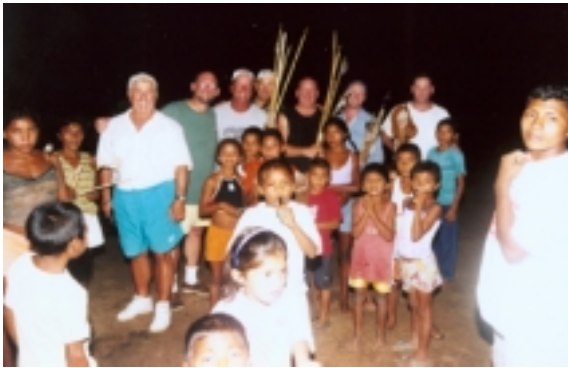
The children of the Indian village, Sapukaia, found our fishermen extremely interesting.