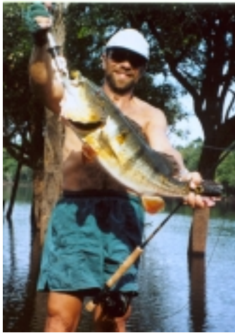
Clear black water made fly-fishing very productive.